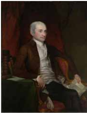
John Jay, by Gilbert Stuart, completed 1818, public domain

As noted with regard to the flawed attempt by Congress to amend by a statute the Constitution’s provisions regarding who is, and who is not, a “natural born Citizen,” discussed here , H.R. 51 cannot amend or supplant the 23 rd Amendment. Only a constitutional amendment can amend the Constitution.