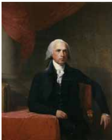
James Madison, by Gilbert Stuart, ca. 1805-07, public domain

Without statehood, the Democrats would still need to rely on Kamala (“of-course-I’m-constitutionally-eligible”) Harris to break any tie votes in the razor-thin 50/48+2 split between the GOP and the Democrats in that “upper” chamber. And with Kamala Harris’s questionable constitutional bona fides still judicially unresolved and sulking on the horizon, two additional senators may be desperately needed sooner rather than later.